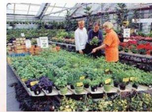
▲ A RANGE OF WOODFUEL HEATING SYSTEMS FROM DOMESTIC TO SMALL BUSINESS SCALE