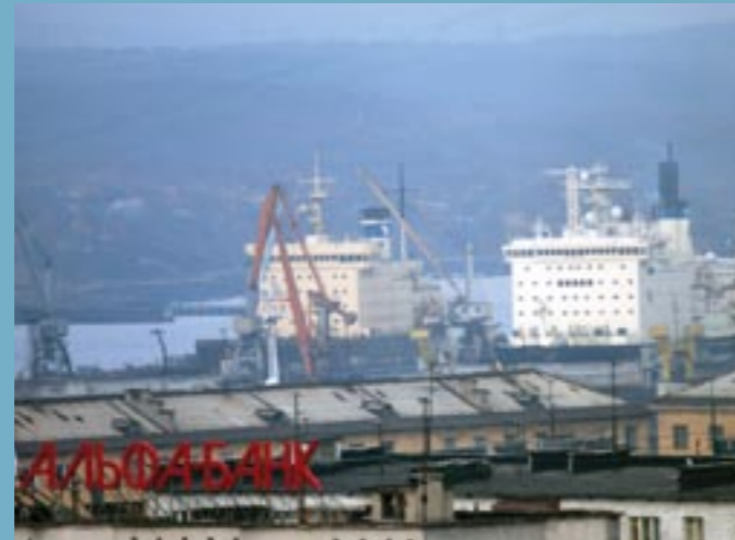
Both Murmansk and Archangelsk harbour are directly connected to the Russian railroad network.