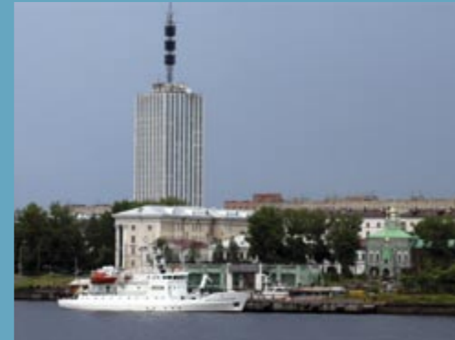
In the case of Archangel, ice classed tonnage will be essential.