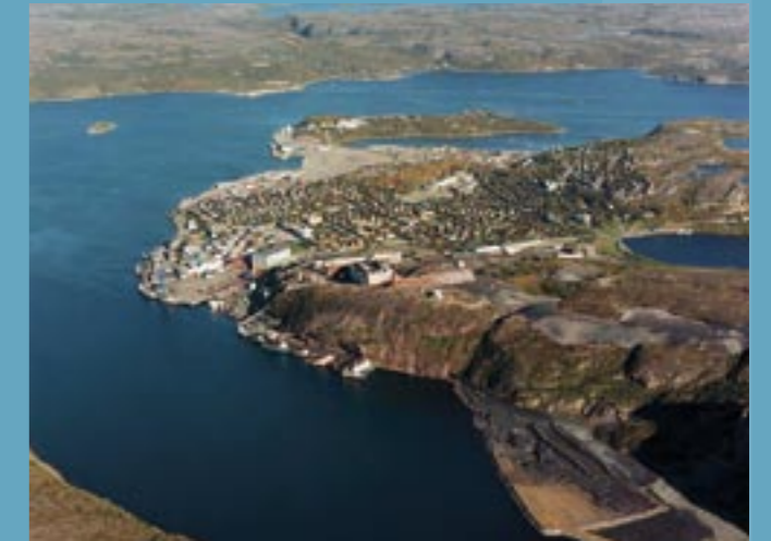
From Kirkenes the distance to the Russian railroad network is only 40 kilometers. Building a rail link across the border has an estimated cost of 250 million €. Photo: Kirkenes Harbour